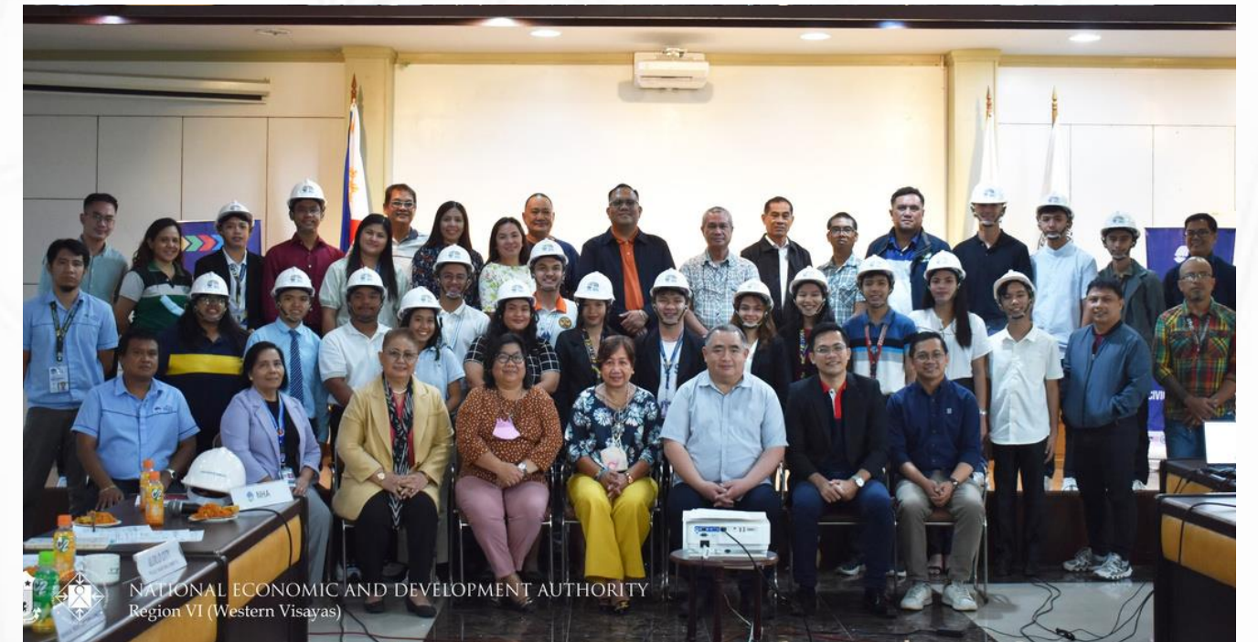
NATIONAL ECONOMIC AND DEVELOPMENT AUTHORITY Region VI (Western Visayas)